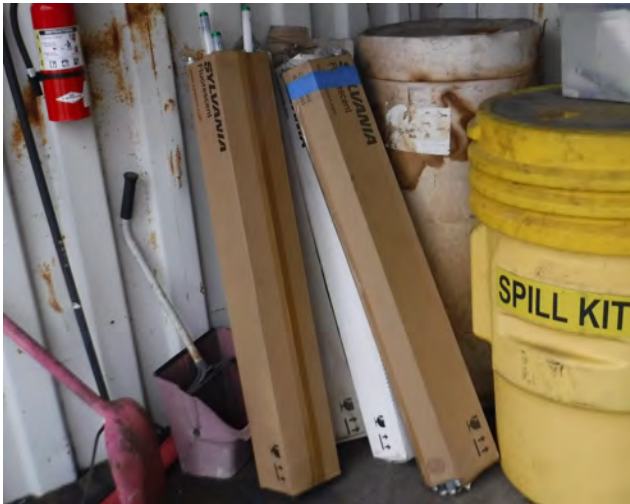
Before - Open Boxes of UW Lamps