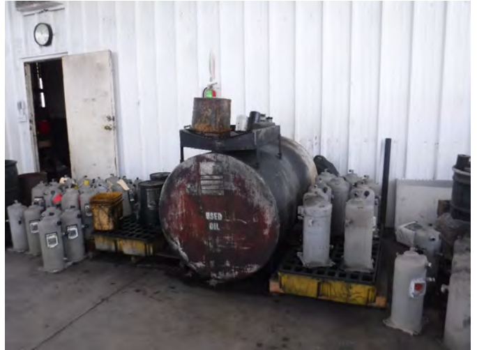
Aerosol Can Puncturer System