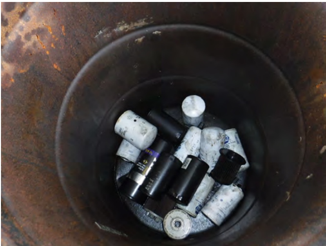
Used Oil Filters