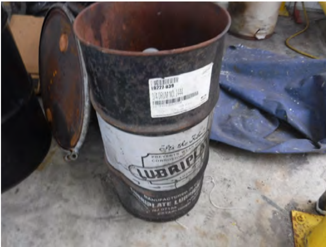
Before- Unlabeled 55-gallon Drum of Used Oil Filters