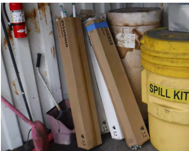
Before - Unlabeled Boxes of UW Lamps