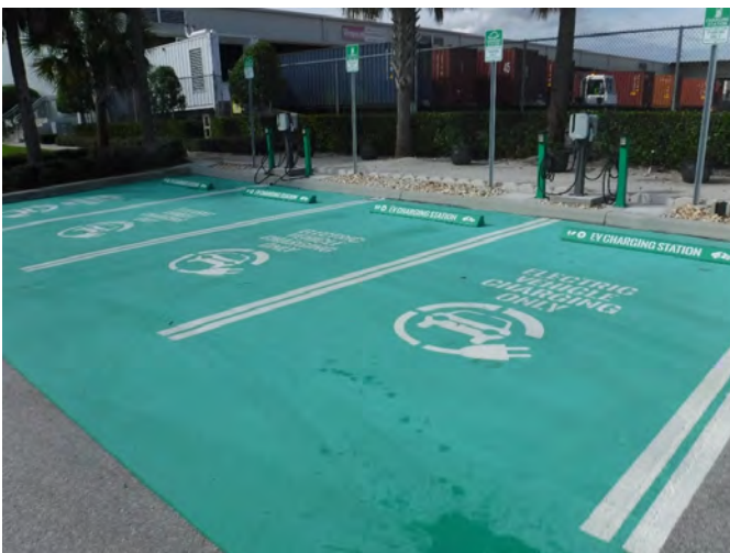
Electric Vehicle Charging Station (P2 Project)