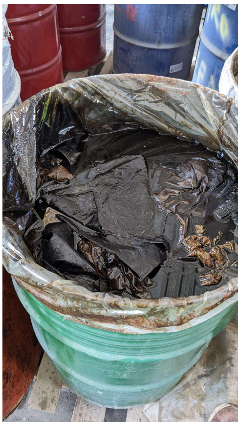
Item 7 - Original condition