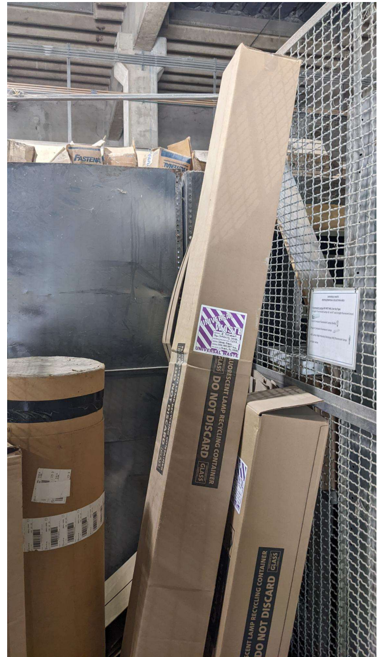
Item 11 Corrected – Waste fluorescent straight lamps boxed and labeled as universal waste in designated accumulation area.