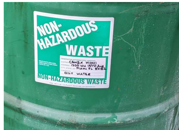
Item 7 Corrected - Oily Water label attached