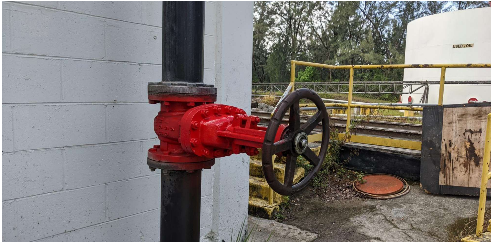
Item 8 Corrected – Leaking valves and connection points repaired at Used Oil Receiving.