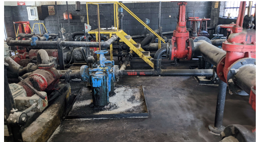
Item 8 Corrected – sorbent material cleaned from floor of used oil receiving