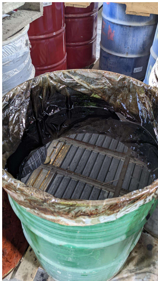
Item 7 Corrected – solids removed from drum