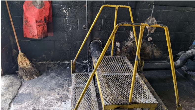
Item 8 Corrected – sorbent material cleaned from floor of used oil receiving