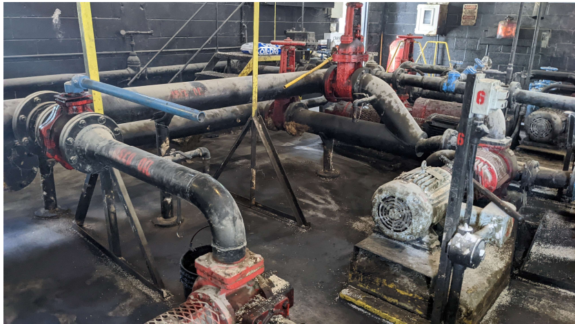
Item 8 Corrected – sorbent material cleaned from floor of used oil receiving.