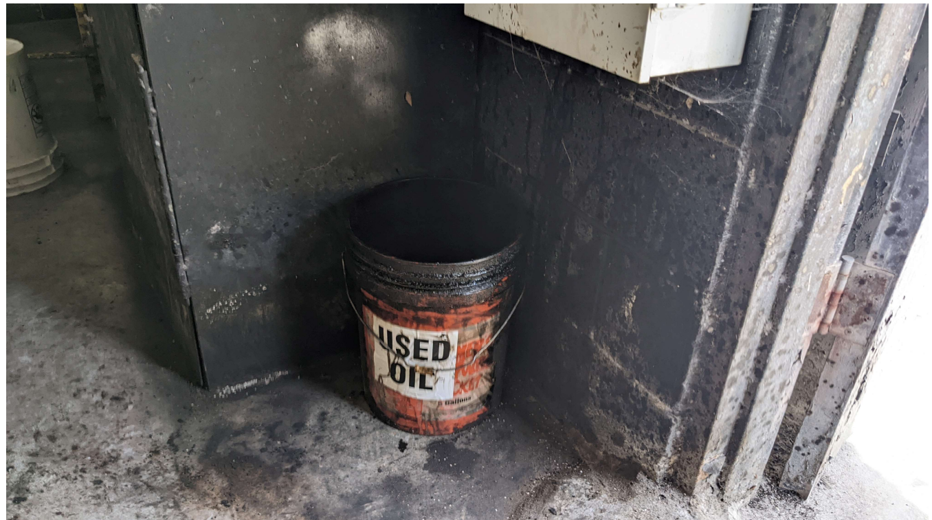
Item 9 Corrected – sorbent material cleaned from floor of used oil receiving and bucket clearly labeled.