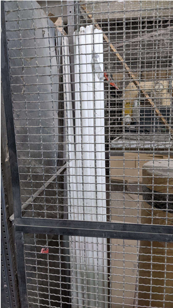
Item 11 Original – Waste fluorescent straight lamps not boxed in universal waste accumulation area