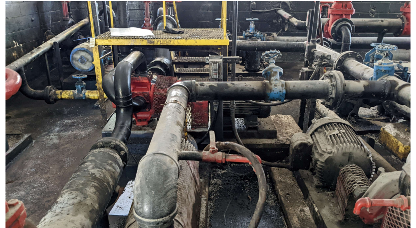
Item 8 Corrected – sorbent material cleaned from floor of used oil receiving