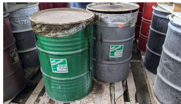
Item 7 Corrected - Separate Oily water and oily debris/waste drums both labeled