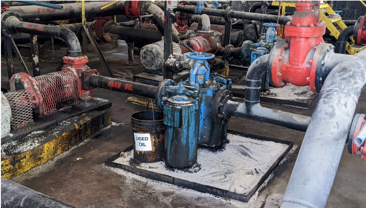
Item 9 Corrected – sorbent material cleaned from floor of used oil receiving and bucket clearly labeled.