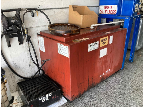
Shop used oil tank and used oil filter drum