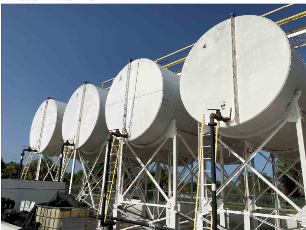
Photo 2 Secondary containment