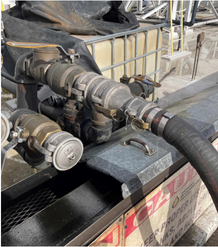
Photo 4 Collection truck