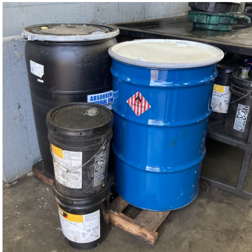
Waste absorbent drum