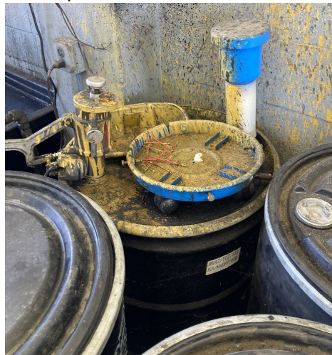
Waste paint drum