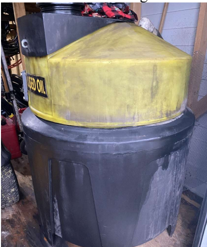
Photo 2 Spill kit