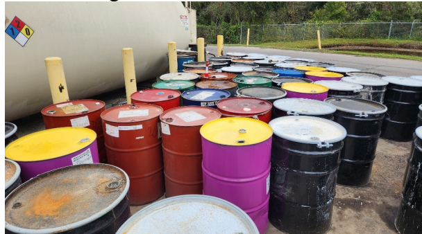
Drum Storage Area