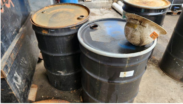
Improperly labeled Used Oil Filter Drums