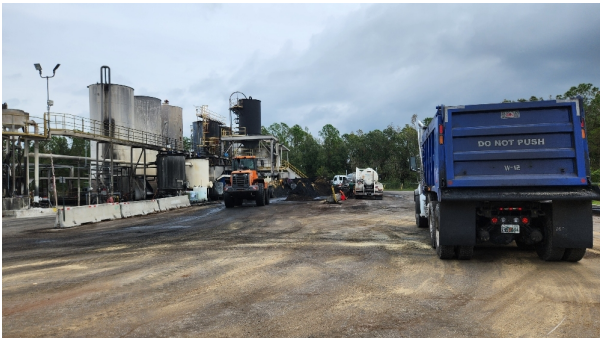
Front Tank Farm