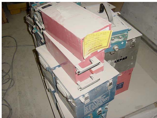
Figure 12: Label for pallet of batteries.