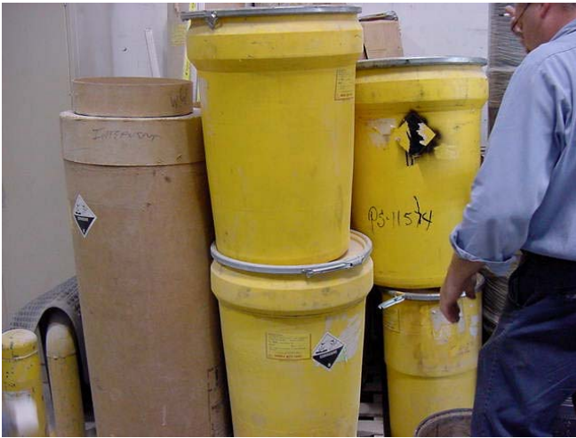
Figure 9: Mercury containing bulbs, no date