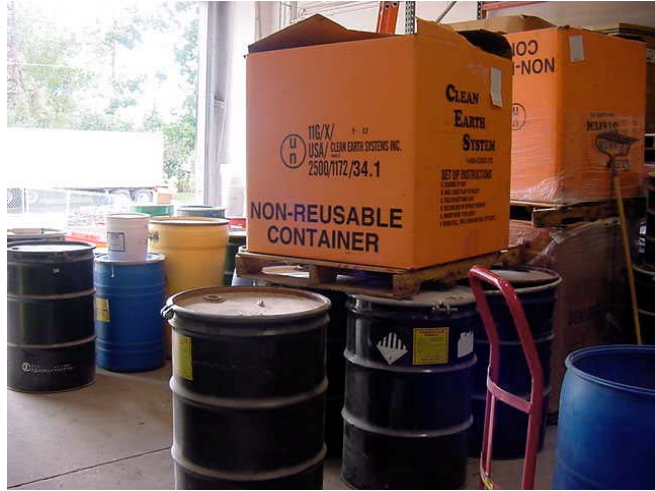
Figure 8: Loading dock area