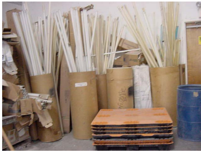
Figure 10: Plastic coated bulbs