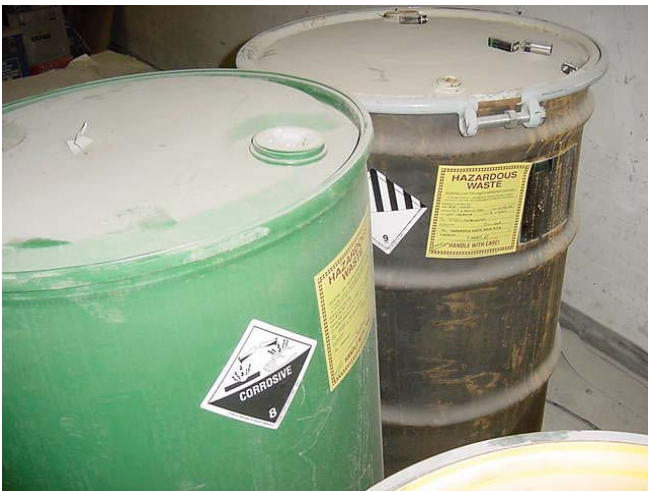
Figure 11: HW containers w/o dates