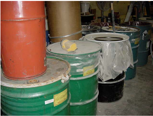
Figure 7: Containers of batteries