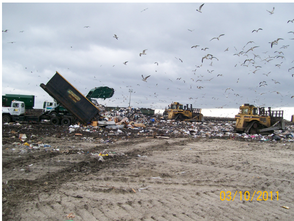
working face photo 1