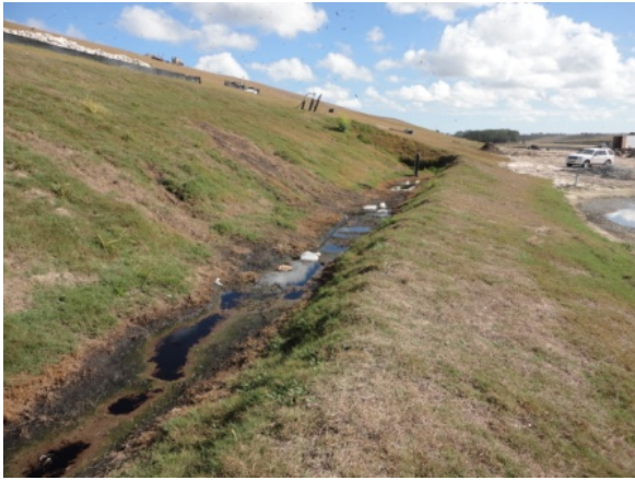
Toe Drain on South Side Slopes