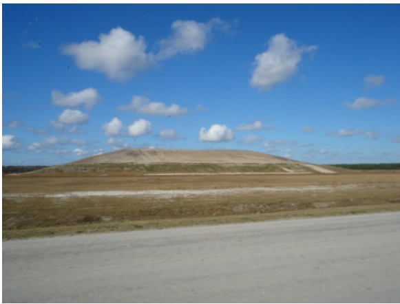
Class I Overview