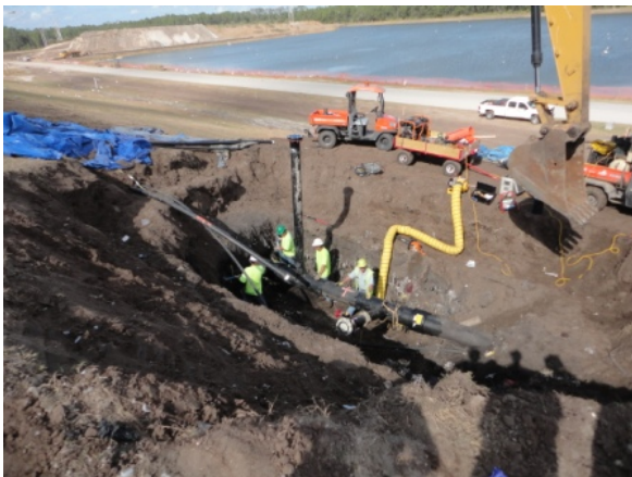
Header Tie-in Construction