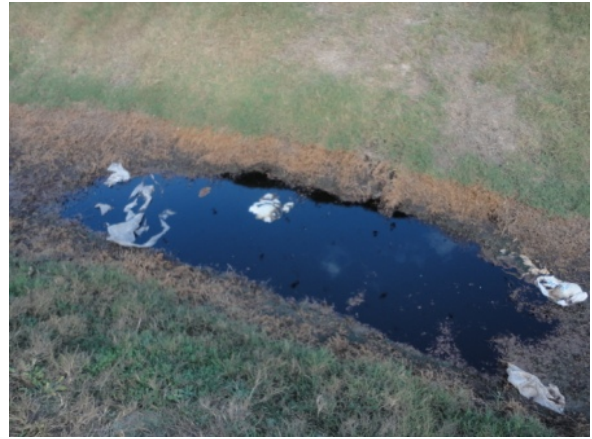
Toe Drain Leachate Accumulation