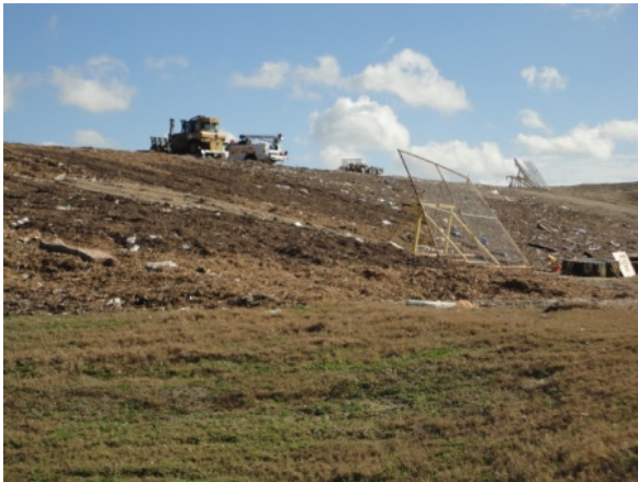
Class III Landfill