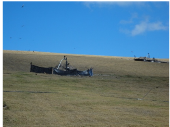
Vertical Gas Well Construction