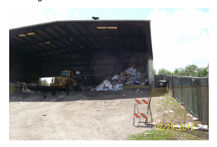
Loading Area for Waste Transfer