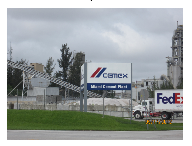
Tire fluff and biomass