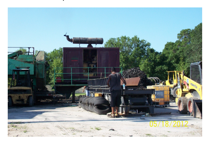
Storage and Loading Area