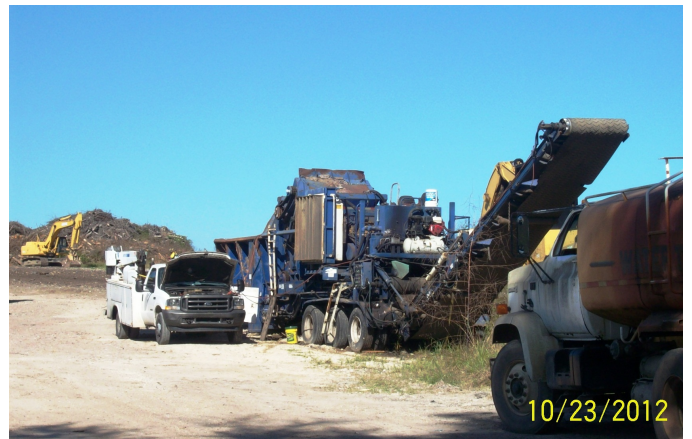
YT Grinding Equipment Onsite