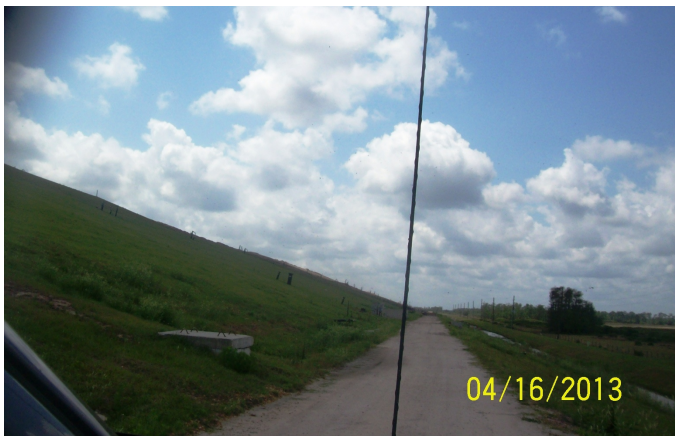
Western Slopes of Partial Closure