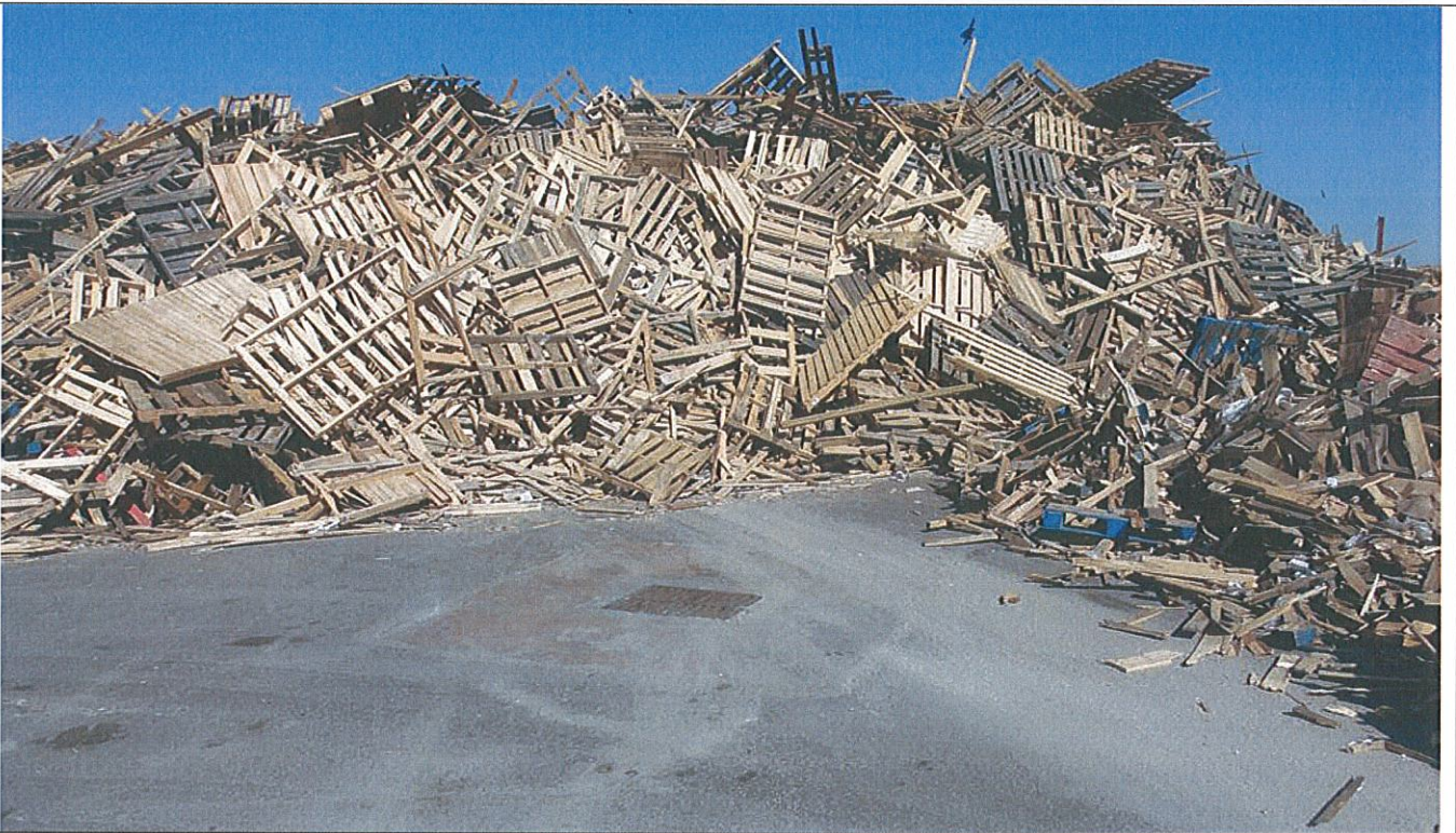
Photograph # 6 S.W. storm water retention pond drain appears unobstructed.