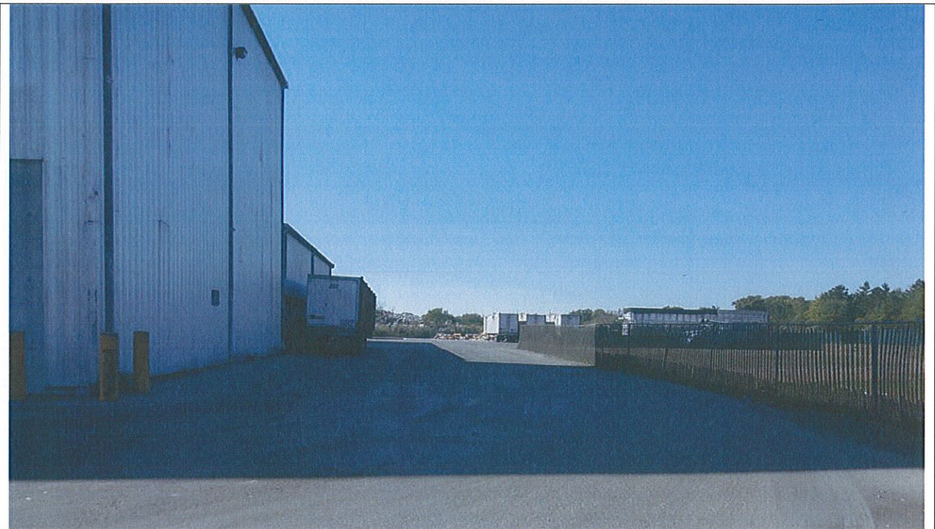
Photograph # 4 Access road/parking lot on the W. side of the facility facing S.