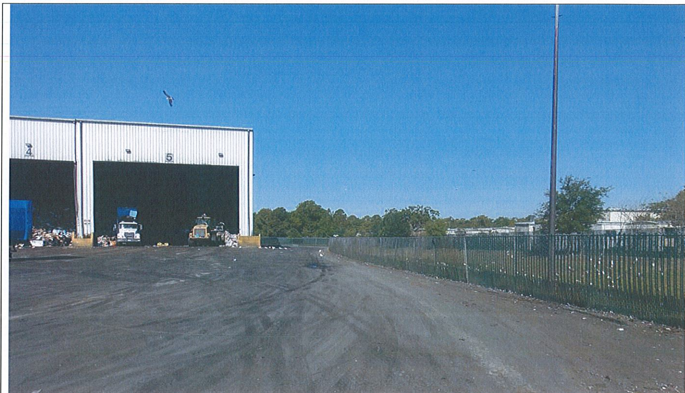
Photograph # 1 Access road parking lot facing W.