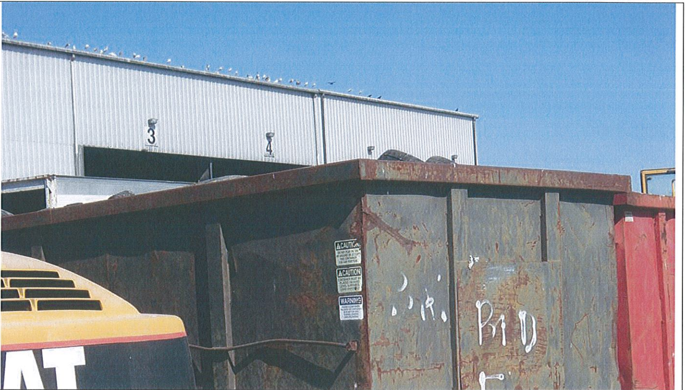
Photograph # 10 Roll off filled with waste tires.