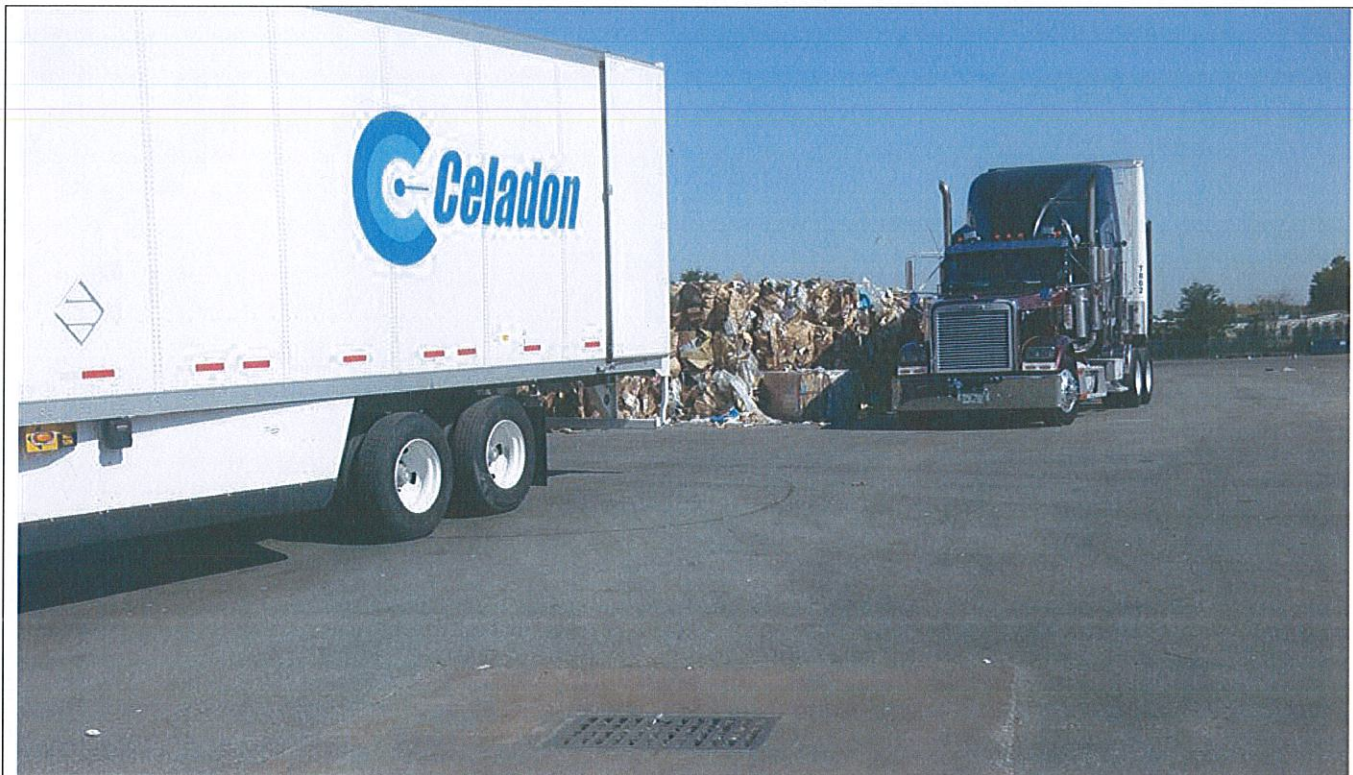
Photograph # 7 S.E. storm water retention pond drain appears unobstructed.