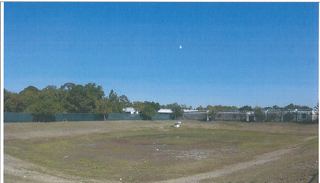
Photograph # 8 Storm water retention pond was clean.