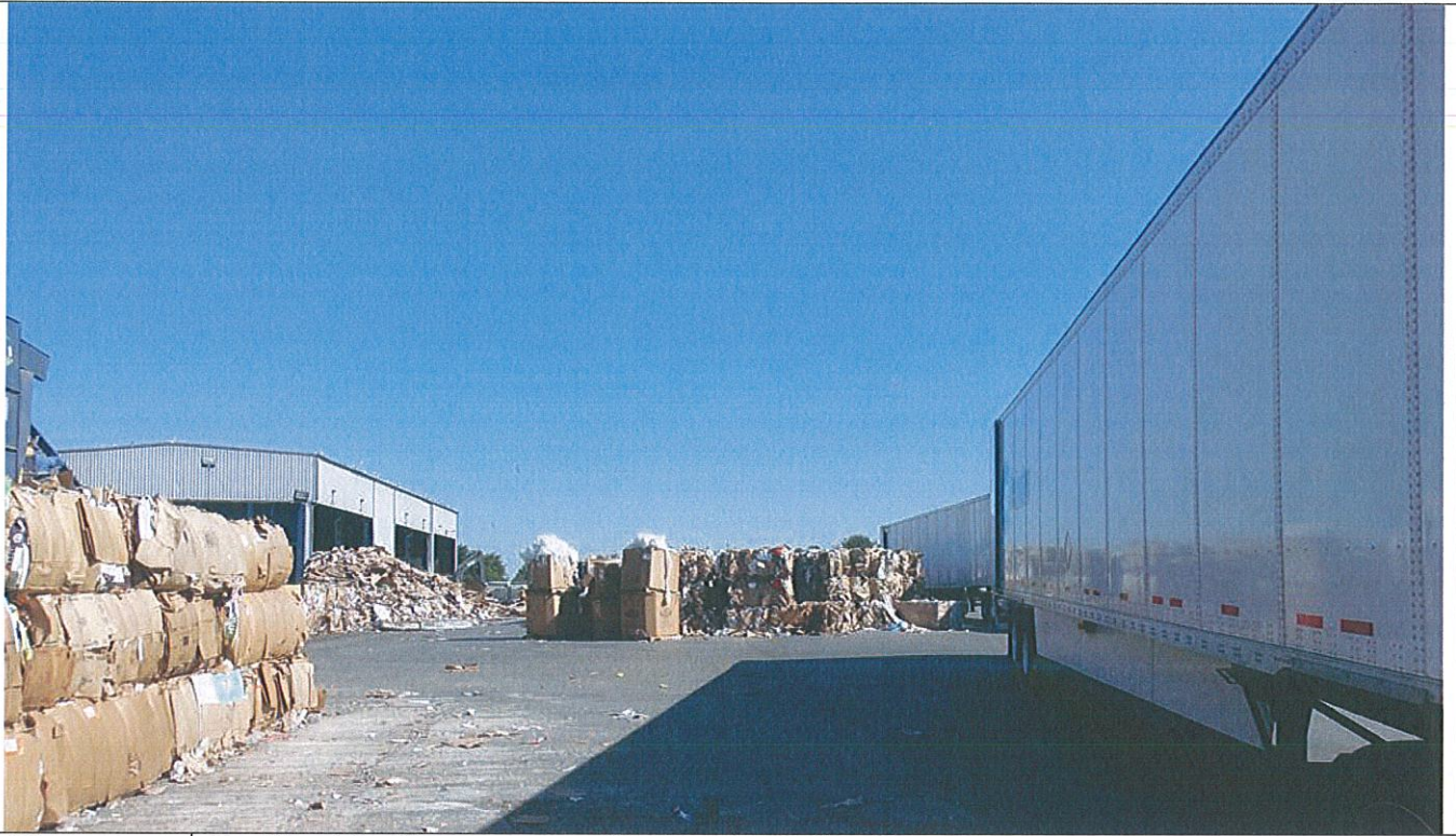
Photograph # 5 E. side of facility access road/parking lot facing N.