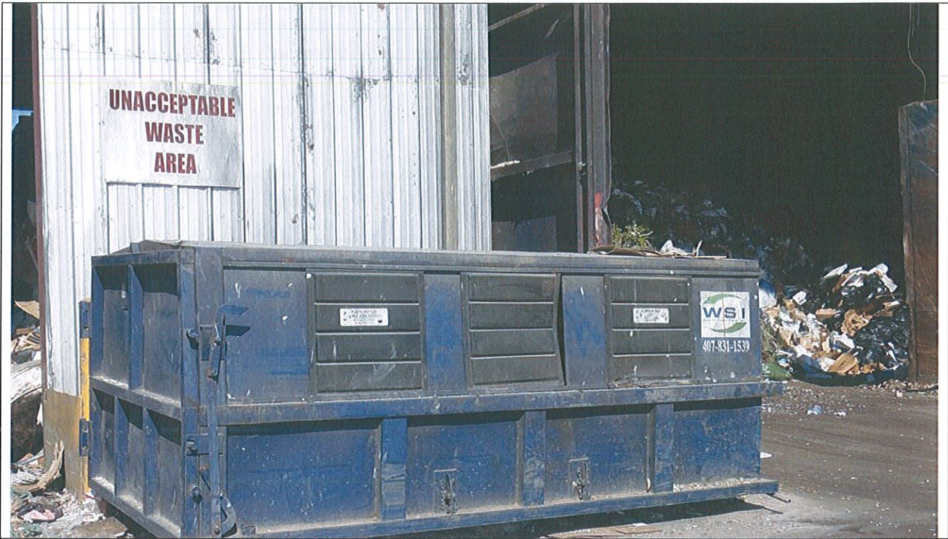
Photograph # 3 Fully enclosed unauthorized waste storage roll off.