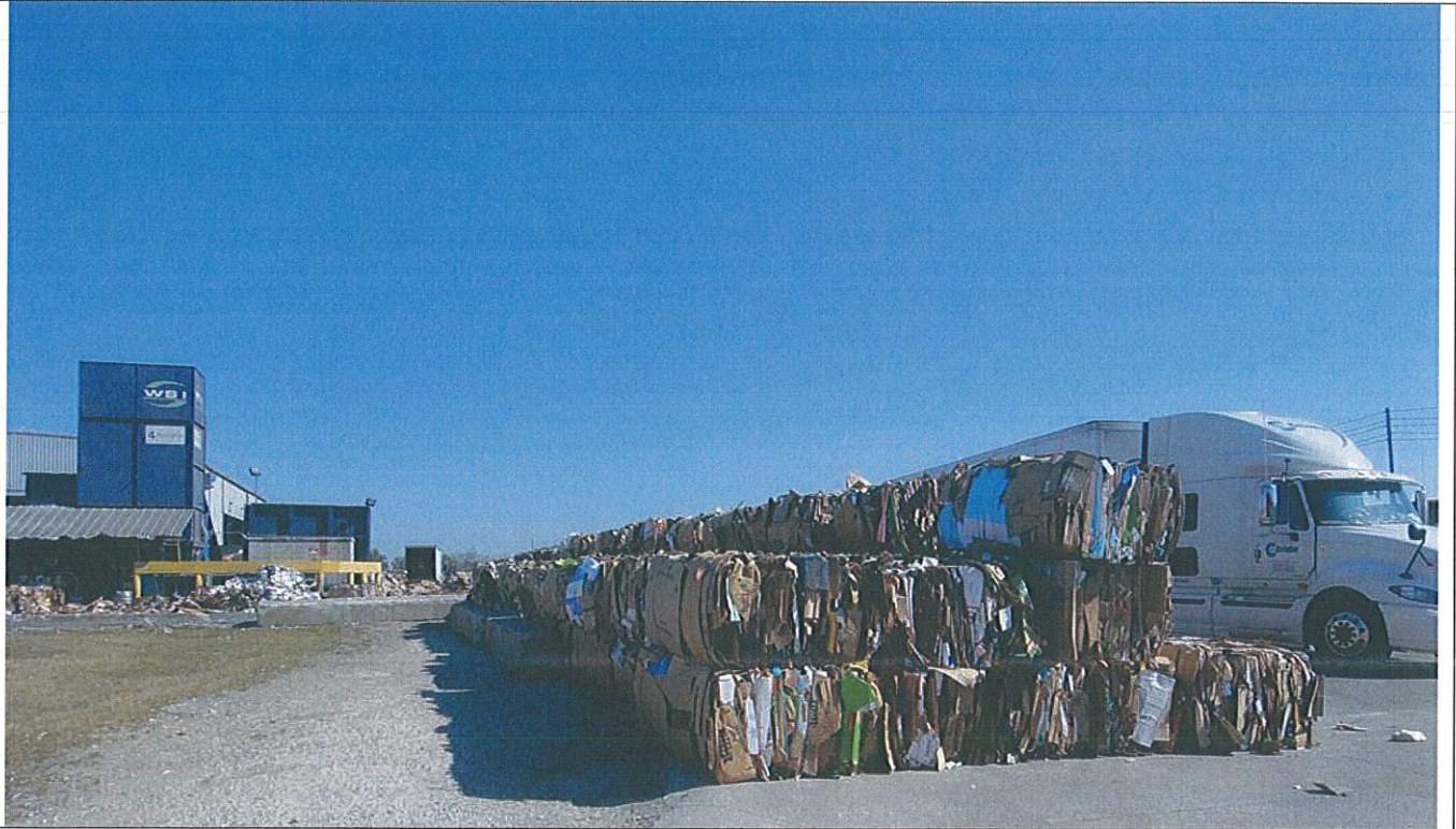
Photograph # 9 Baled cardboard stored on E. side of facility access road/parking lot.