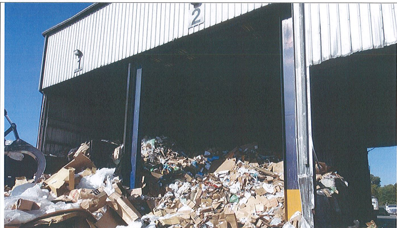
Photograph # 2 Waste was observed standing beyond doors 1 and 2 on access road. Please see notes section.