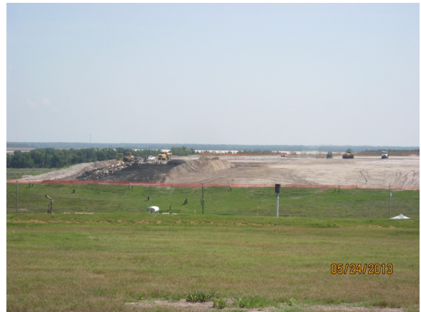
Section 9 WF (from Phase I-VI)