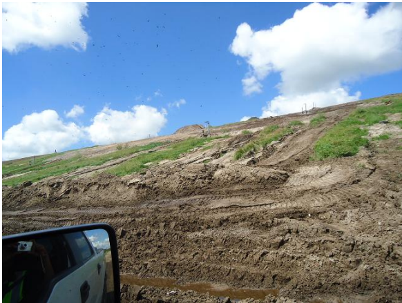
Repairs in progress - east slope