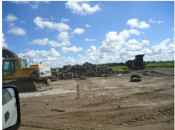
Waste tire processing facility