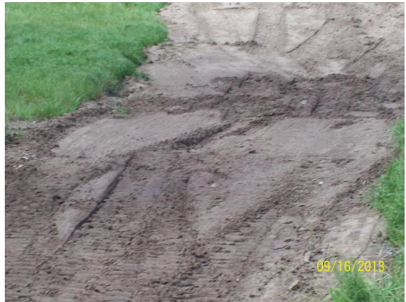
Received 9-16 - repairs complete