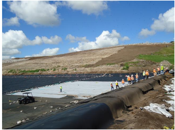
Liner installation -2