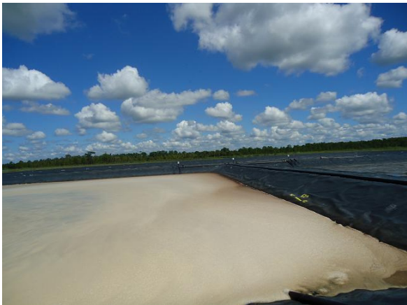
LCS - Leachate pond