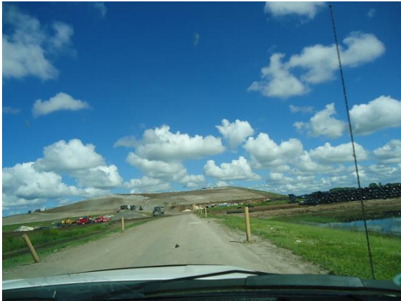
Entrance to working face