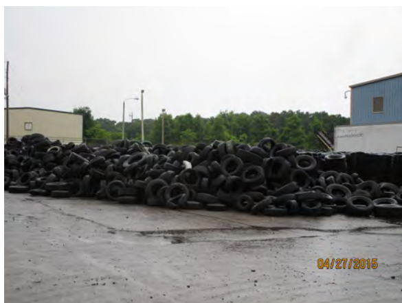
Outdoor waste tire storage