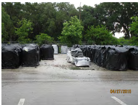
Finished product storage area