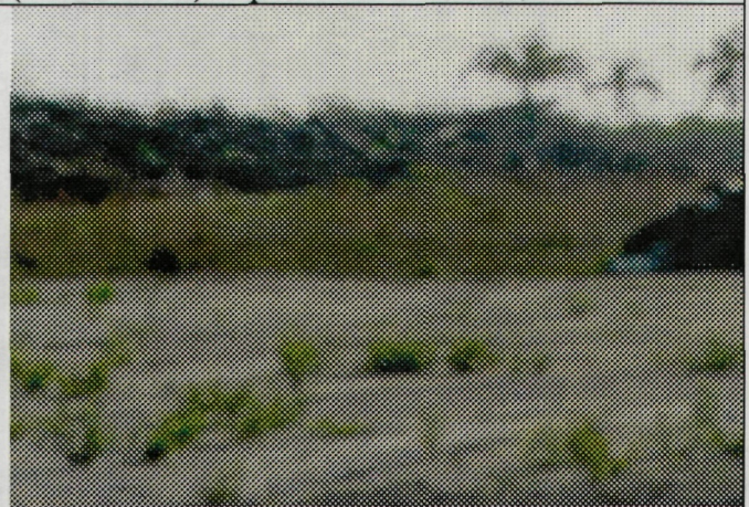
Photo showing windrow of land clearing debris disposed of on site, looking northeast.