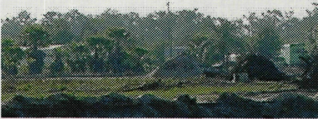
Photo showing palm trees disposed on the property.