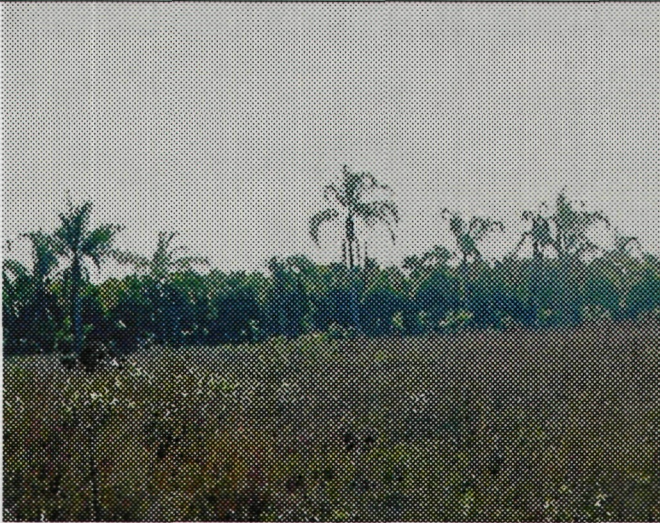
Photo showing a small pile of land clearing debris disposed of on the property, looking east.