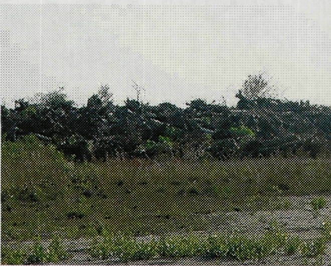
Photo showing a long windrow of land clearing debris disposed of on the property.