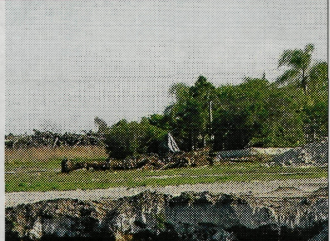
Photo of palm trees disposed of on site, looking north.