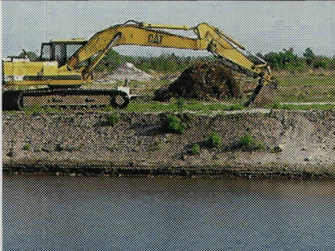
Palm tree debris disposed of on site, looking north.