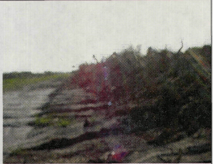
Photo of west end of land clearing debris windrow, looking east.