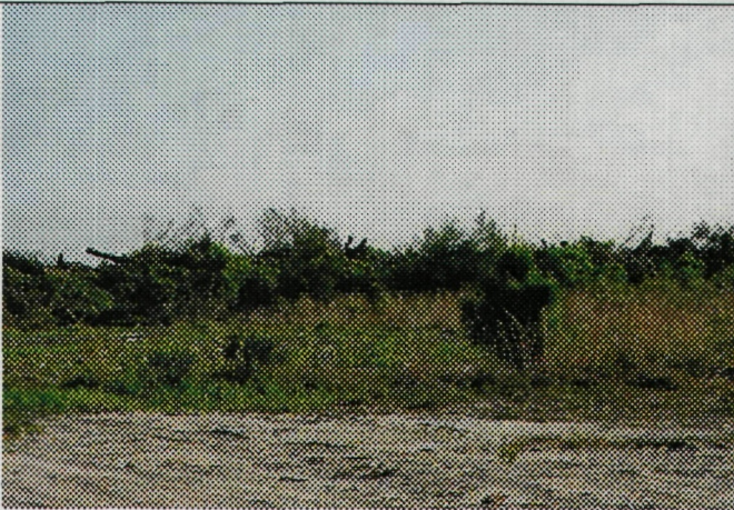
Photo showing off-site land clearing debris disposed of on site, looking northeast.