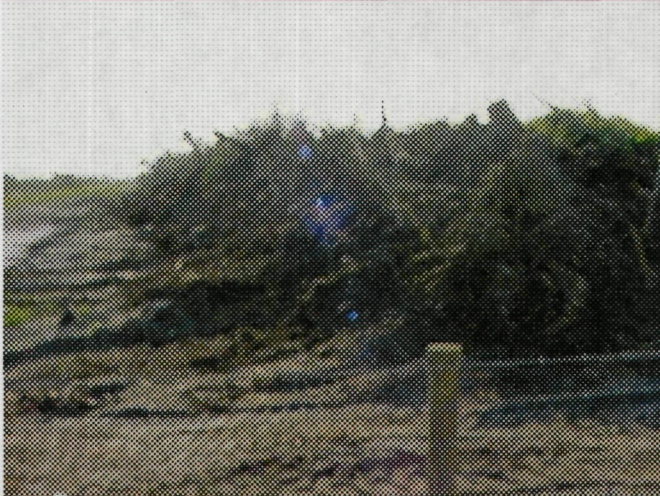
Photo showing west end of land clearing debris windrow, looking east.