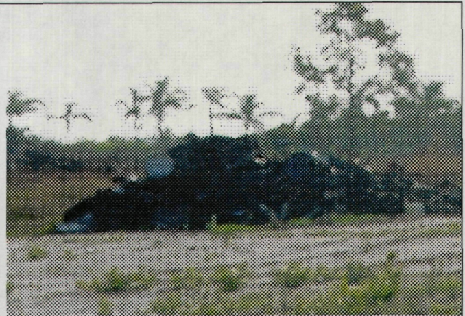
Photo showing a pile of metal debris and white goods (water heaters) disposed of on site.