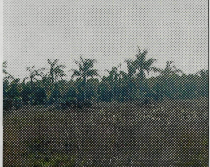
Photo showing two piles of off-site land clearing debris disposed of on the property, looking east.