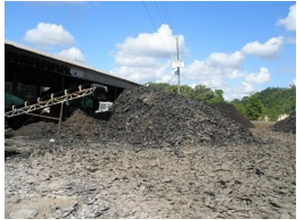
Processing area 4" and 2" chips