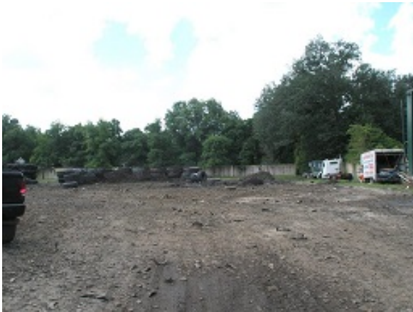
Tires removed from area-complaint