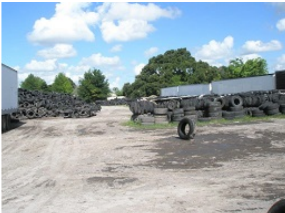
Waste tire storage area -1