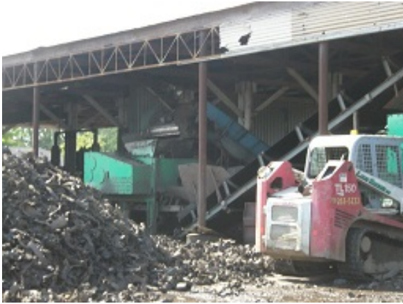
Processing area- rough shreds