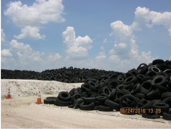
Waste Tire Area