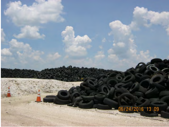
Waste Tire Area