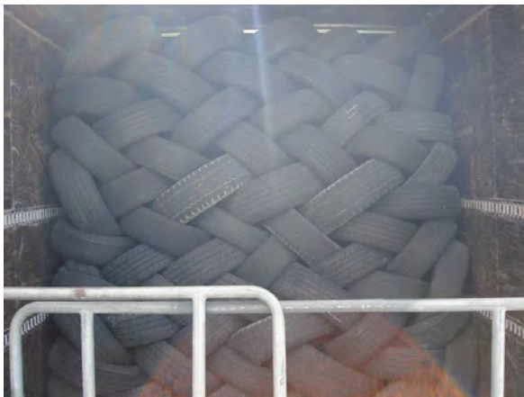
Tire storage in trailer