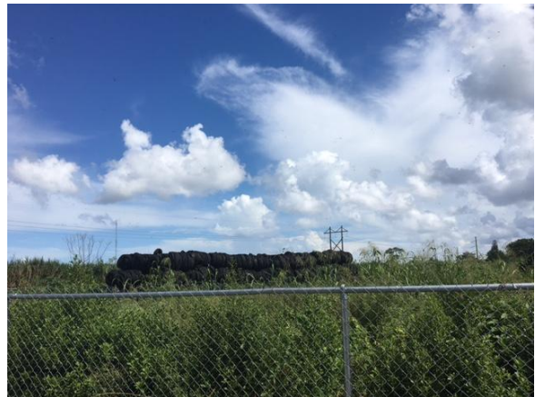
Pile 3 view from fence