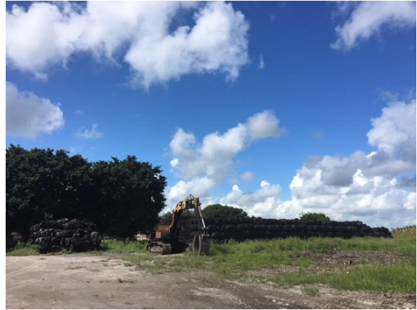
Baled tire piles 1, 2, 3