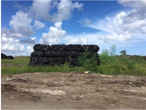
Baled tire pile