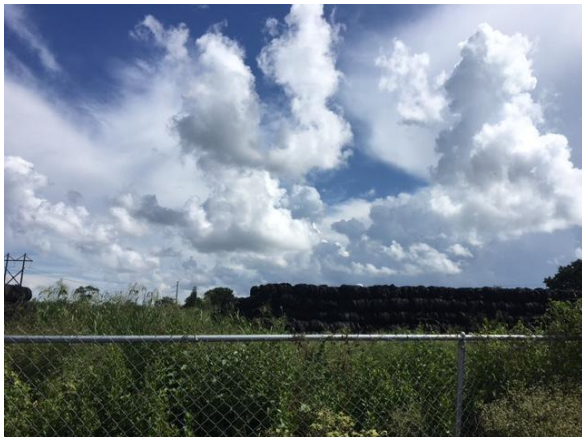
Baled tire pile near to fence