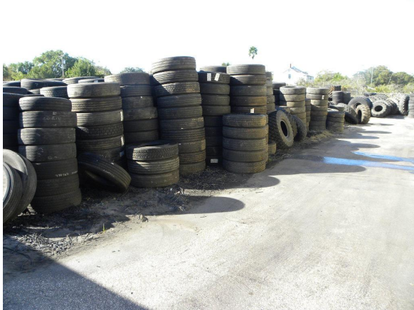
Storage Area SW