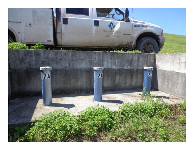
Leachate storage and loadout