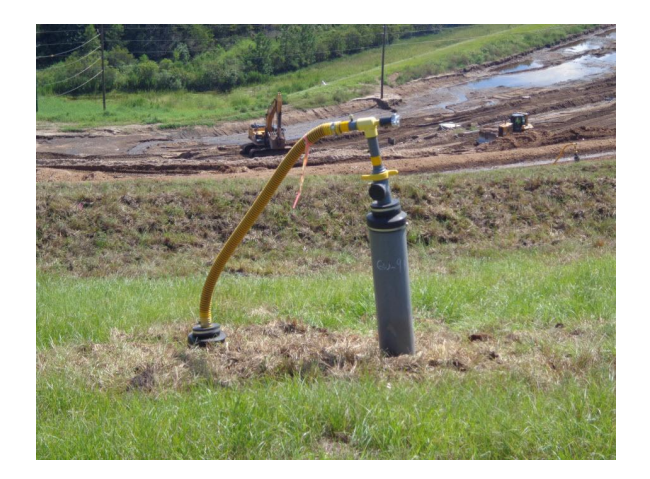
Active working face in Cell 13