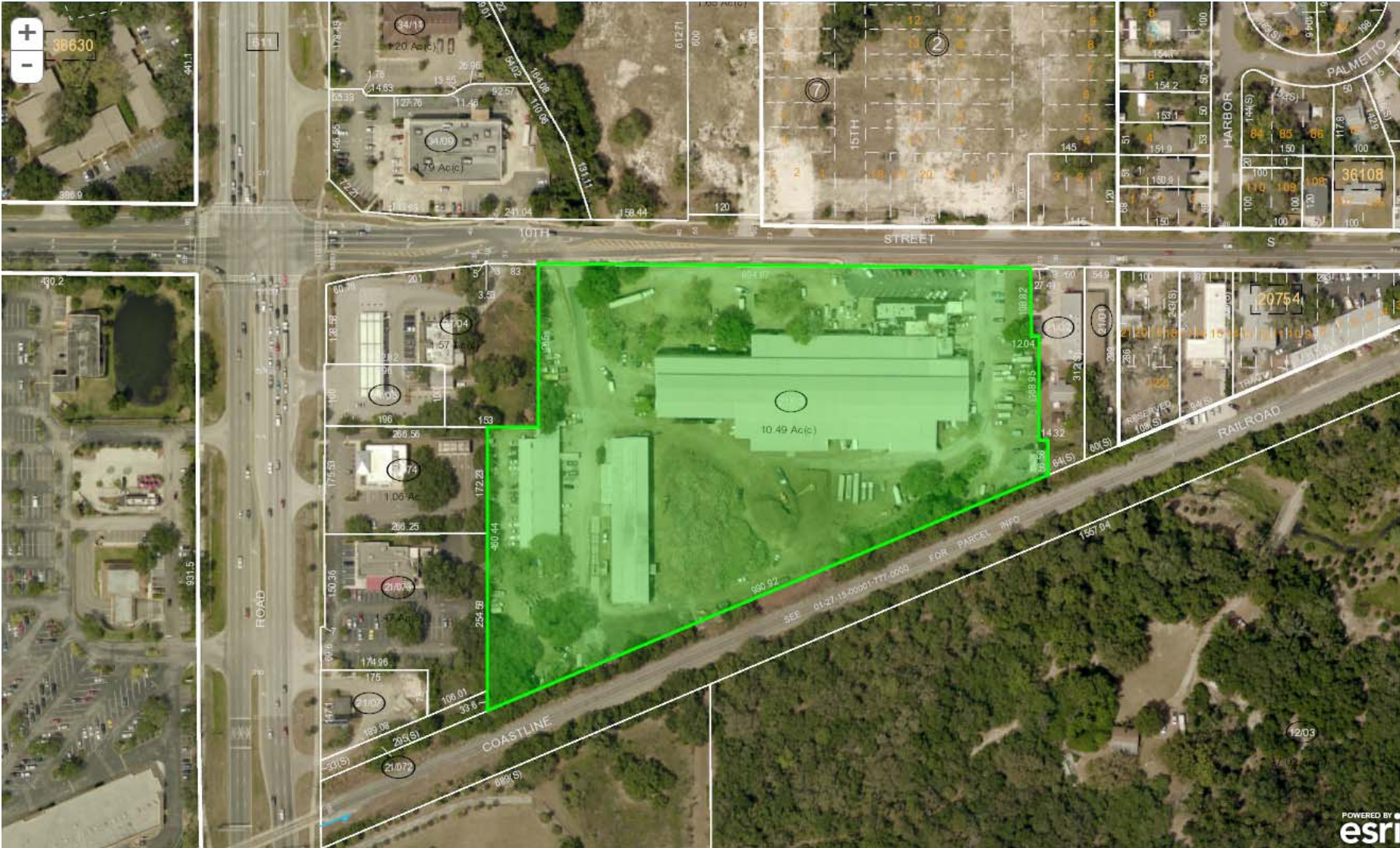
Pinellas County Parcel ID # 09-29-16-00000-210-0300