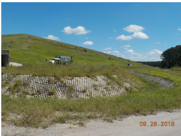
Waste Tire Pile Photo 2