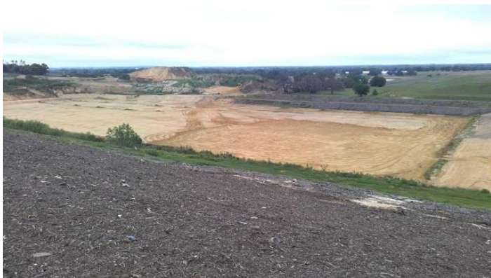
Proposed Cell 17 Overview