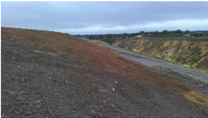
Northern Slope of Cell 15