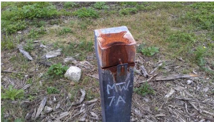
MW-7A: Missing Lock