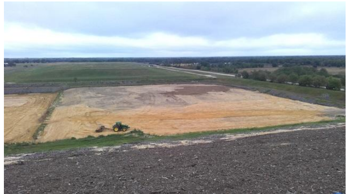
Cell 16 Overview