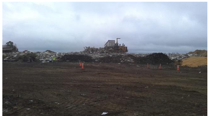
The Working Face