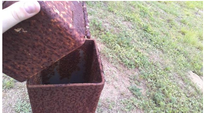
MW-10B: Corroded Hinge