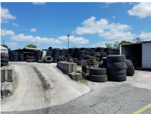
Outdoor storage area