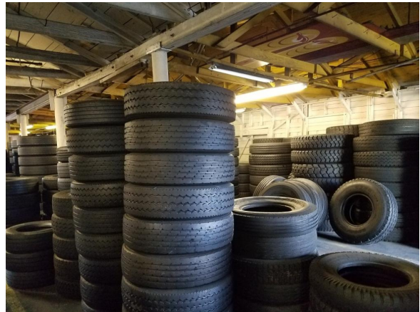
Outdoor storage area