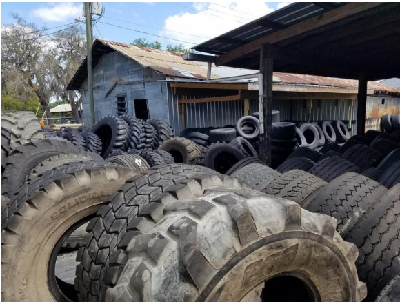
Outdoor storage area