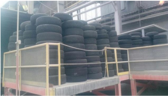
Waste Tire Storage Area - Kiln 1