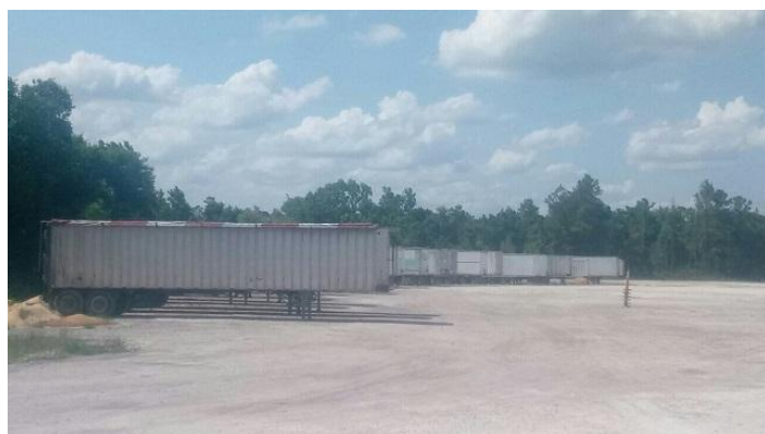
Tire Storage Trailers