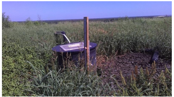
Leachate Sump For Compost Project