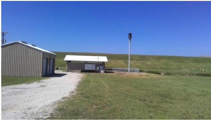
Landfill Gas Flare