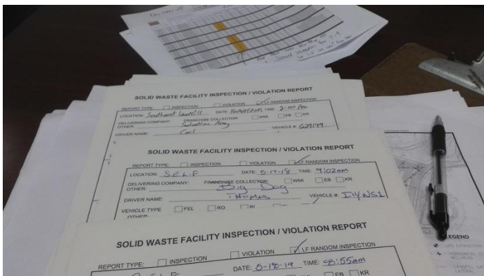
Random Incoming Load Inspections