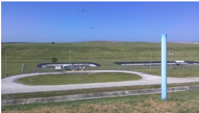
Effluent / Leachate Ponds A & B