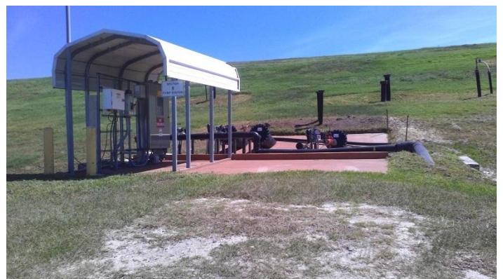
Section 9 Pump Station