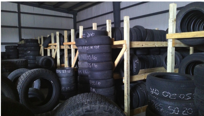
Tire Racks Along NW Wall