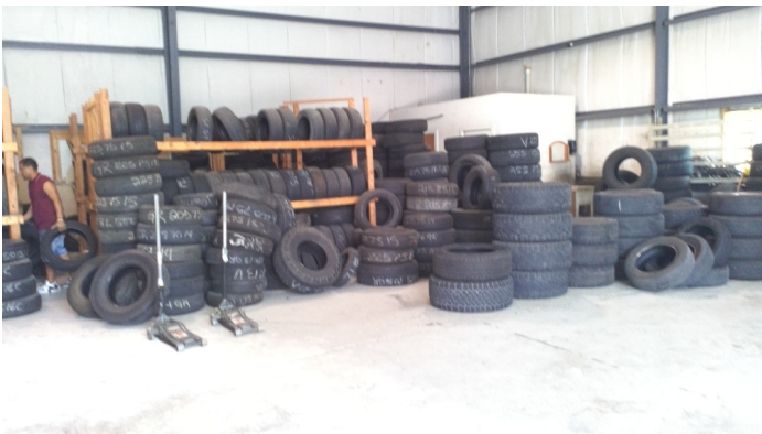
East Side Of Building