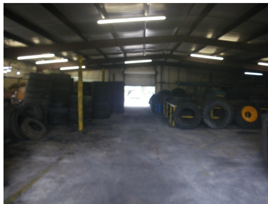
Indoor storage area