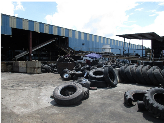
Metal rims to be recycled