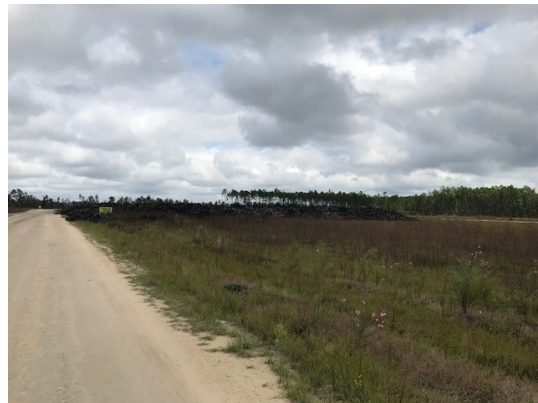
East Side Tire Pile Photo 2