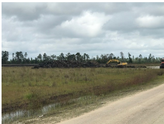
West Side Tire Pile Photo1