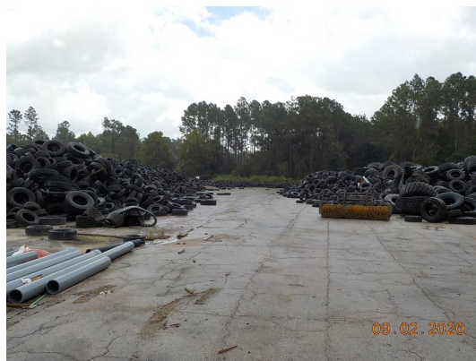
WTPF Photo 2