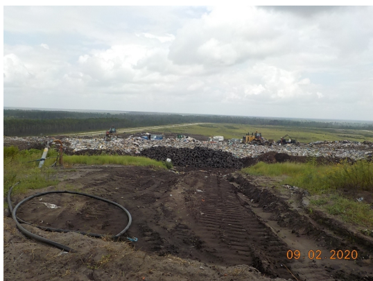
Working Face Photo 1