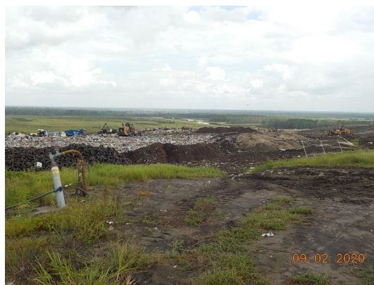
Working Face Photo 2