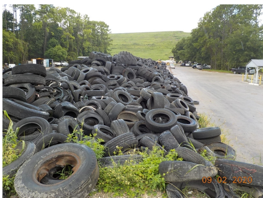
WTPF Photo 3