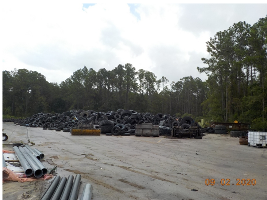
WTPF Photo 1