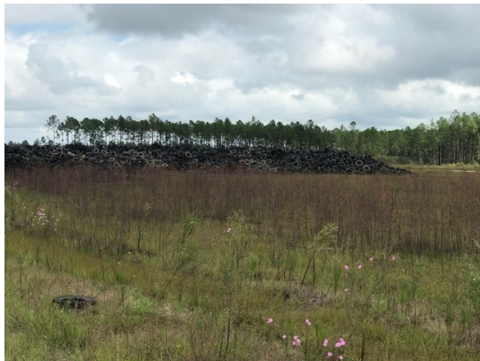
East Side Tire Pile Photo