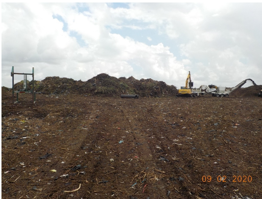
SOPF Photo 2