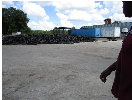
Outdoor storage area