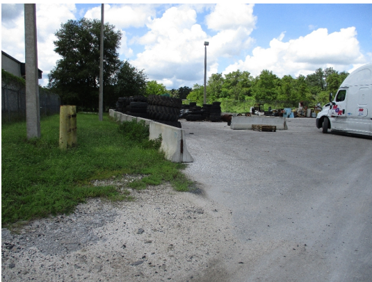
Large tires stored on pallets