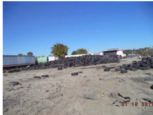
Northwest waste tire pile