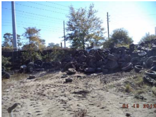
Pile north of processing area