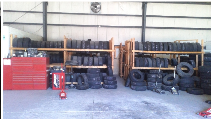
East Side Of Building