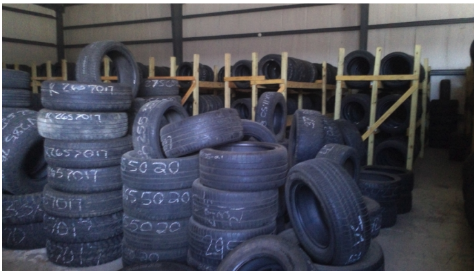
West Side Of Building (Storage)