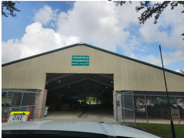
HHW Collection and Storage