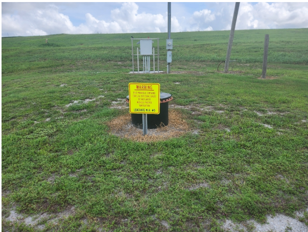
Leachate Manhole M.H. #5