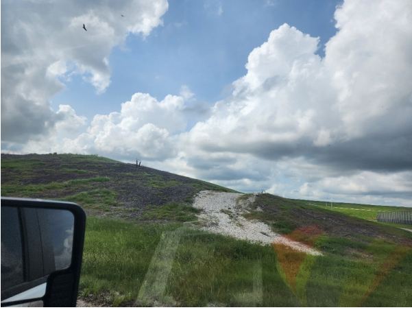
Lack of Cover on W Slope Stage II