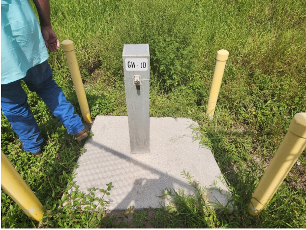
Groundwater Monitoring Well GW-10