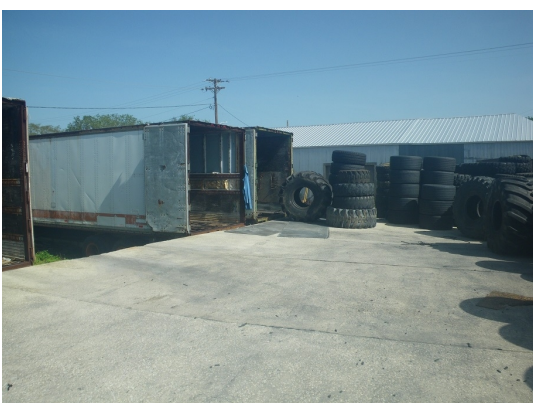
Tire loading zone