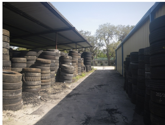
Outdoor tire storage