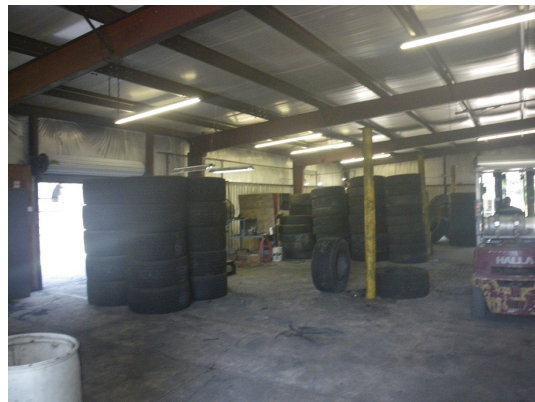
Indoor tire storage