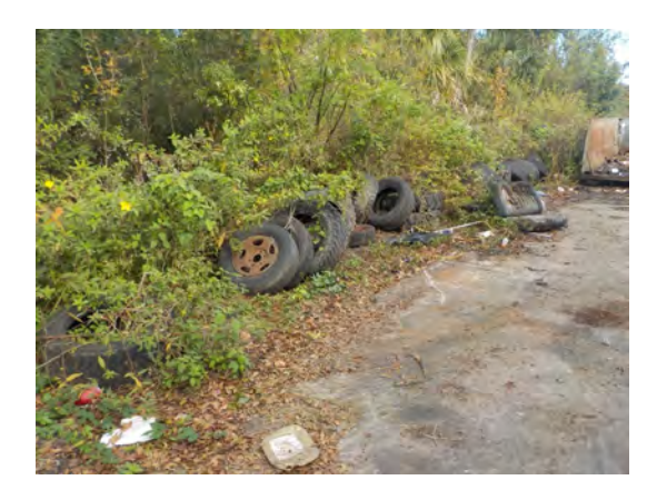
Off-Road Tires Photo 1