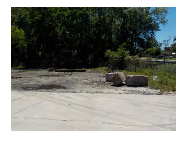
Southeast corner of the Property