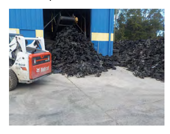
East Boundary Tire Pile