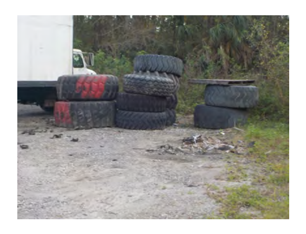
Off-Road Tires Photo 3