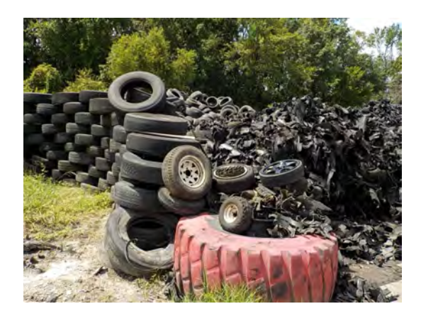
East End of South Pile