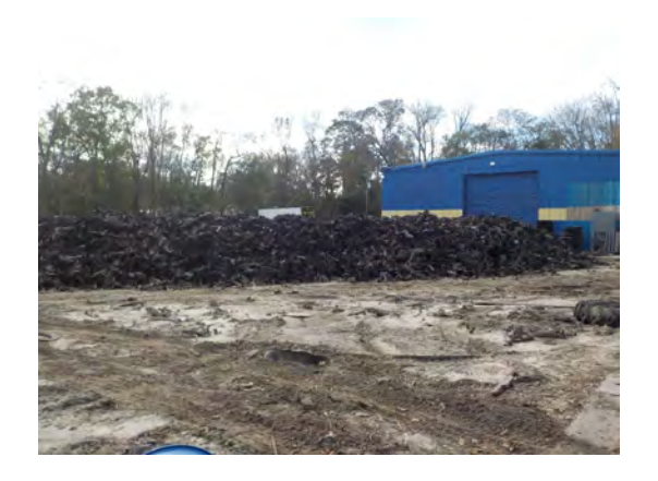
SE Corner Tire Pile