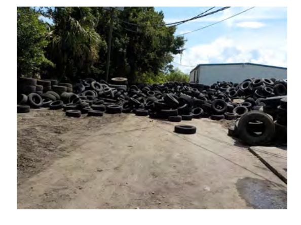
East Pile Shreds on South Side