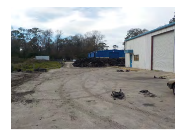
Shreds Adjacent to Shredder