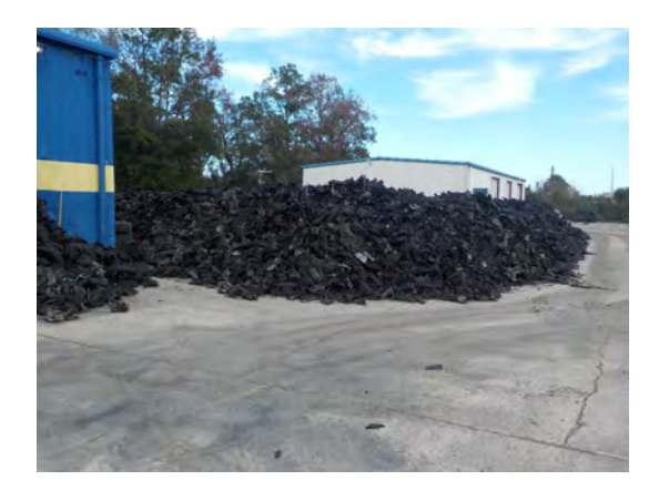
Shred Pile from Northeast