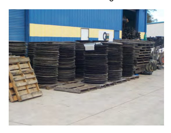
Sidewalls East of Building