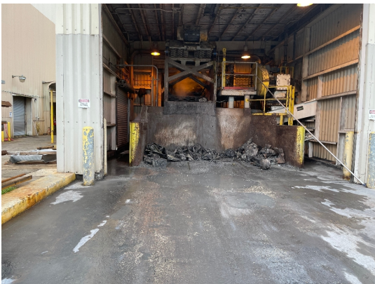
WTE Grizzly Separator