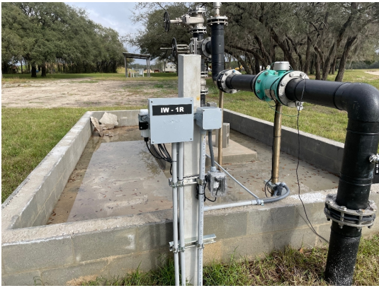
Deep Injection Well