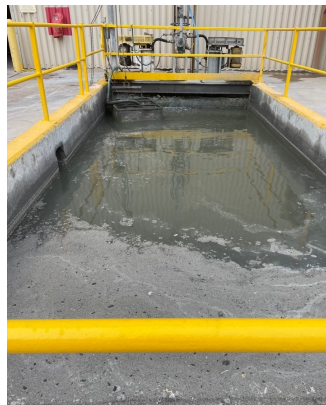
WTE Ash Sump