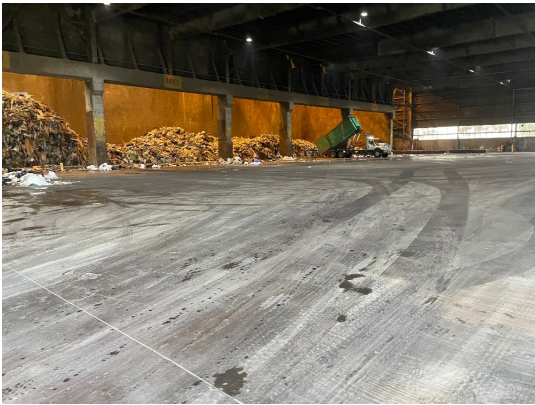
WTE Tipping Floor