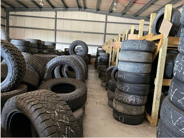
Double-Sided Racks & Tire Pile