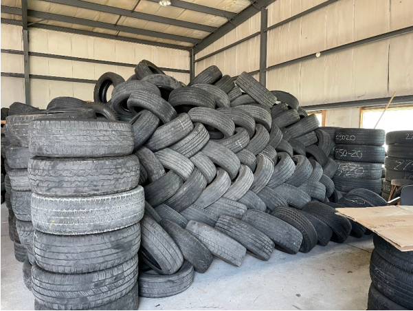
Tire Disposal Area