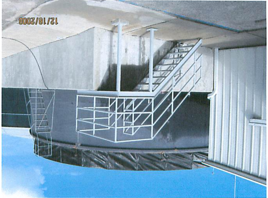
Photograph Number 1

Date: December 18, 2008 Site: Southeast County Landfill, Hillsborough County, FL Description: Exterior of containment area and process tank. View of new filter fabric rim skirt. Looking northwest.