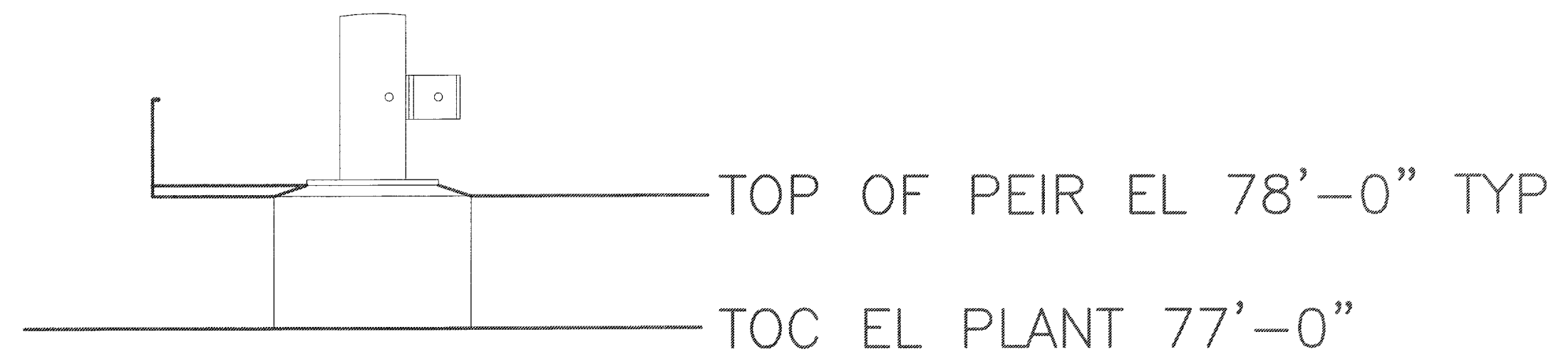
DETAIL D SCALE 1 : 24