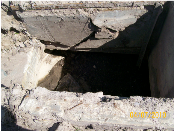
SWMS photo 1