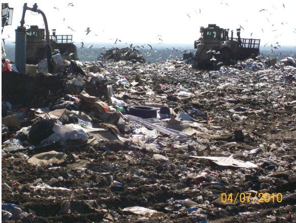
waste tire disposal photo 1